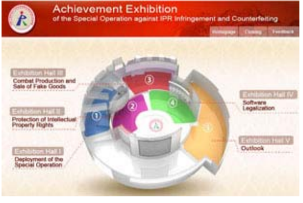
Achievement Exhibition of IPR Protection